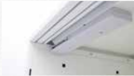
Pull In Unit