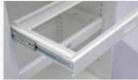
Als Option: Pull Out Frame