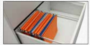
DMW Series Filing Unit