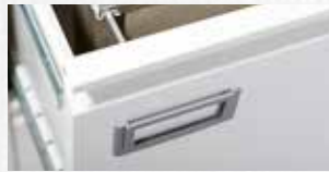
Integrated Handle and Label Holder