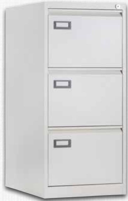
🔍 52 333