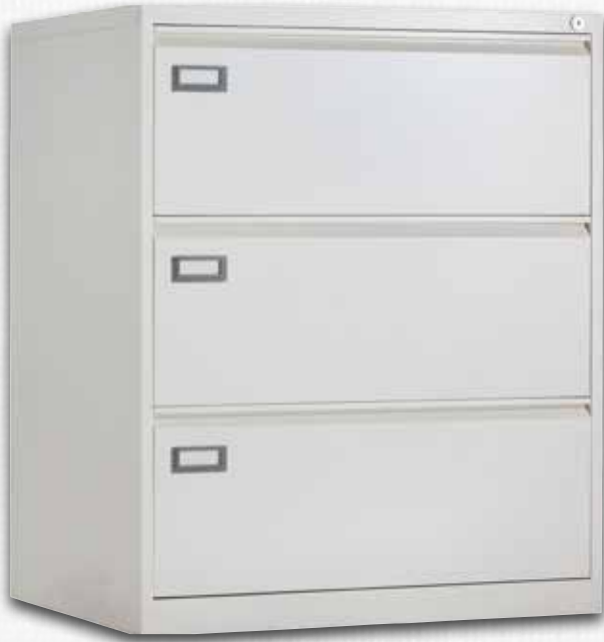
🔍 52 433