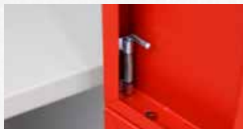
Spring Hinges Doors