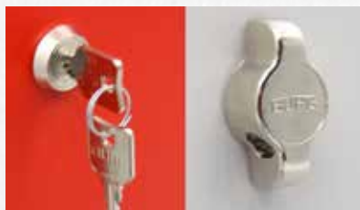
BURG | Cylinder Lock