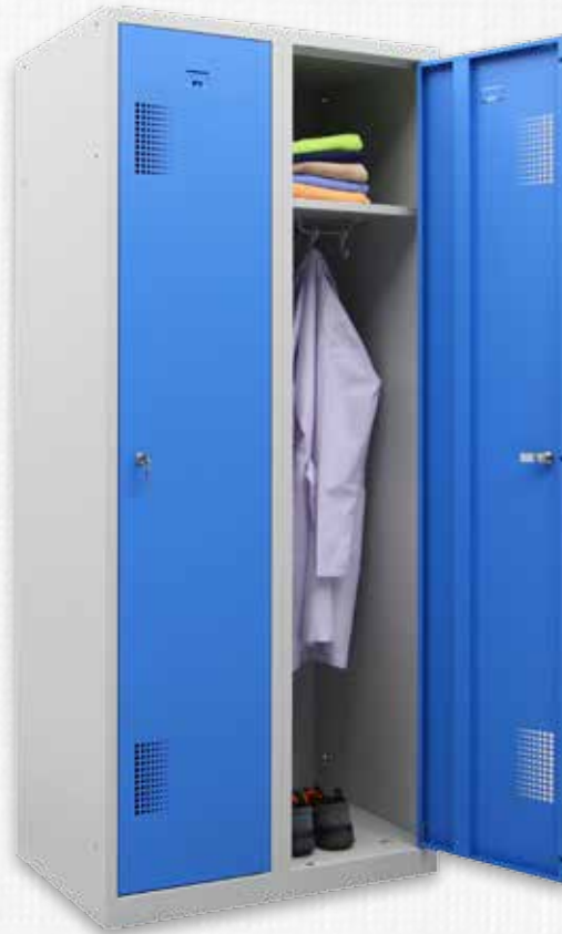
🔍 NHT-20 175