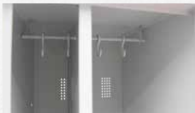
NHTD Clean/Dirty Clothes Divider