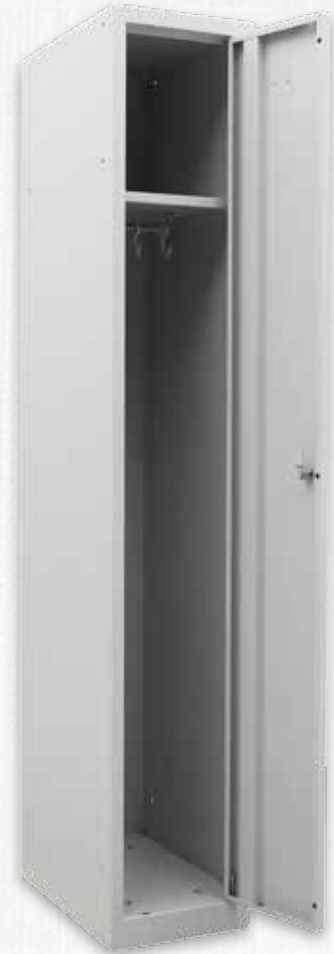
🔍 20 001