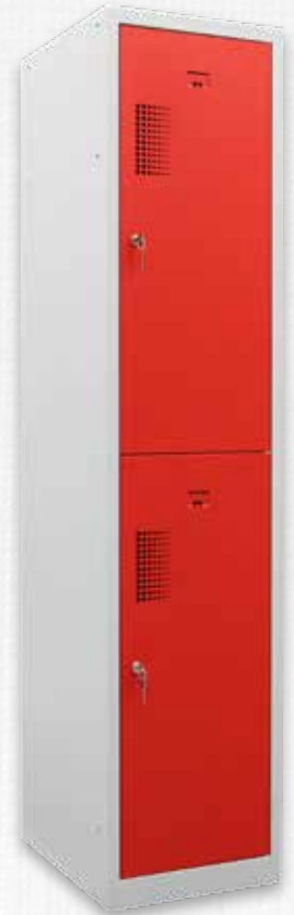
🔍 NHT-20 170