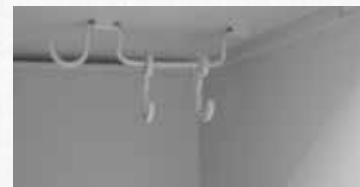
Metal and Plastic Clothe Hooks