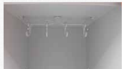
NHTD with Clothes Bar and Plastic Hooks