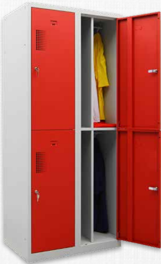
🔍 NHTD-20 190