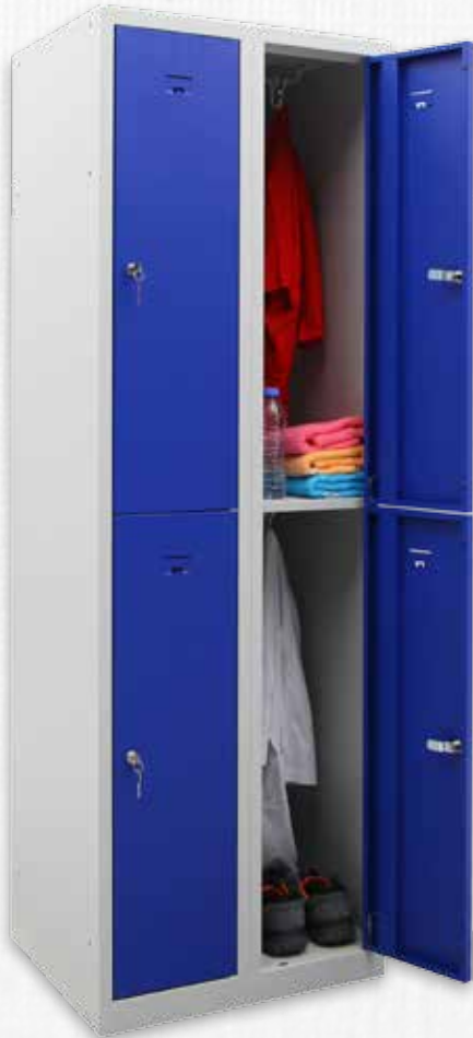
🔍 20 008